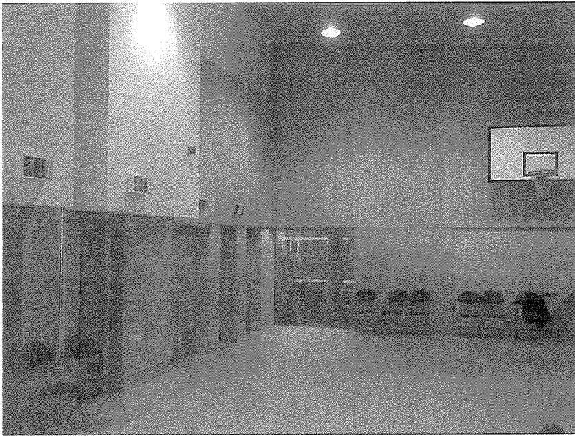
Part interior of hall to be used for regulated entertainment.

There has been seven complaints regarding loud music from the premises since 3 rd July 2011. Only one noise nuisance ( and licensing infringement ) has been witnessed, please see details below.