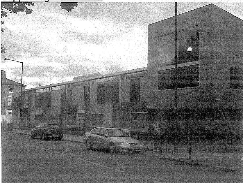
Front of premises facing on to St Anns Road N15.